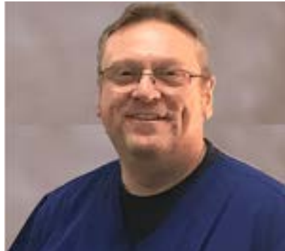
Glen Clinical Staff