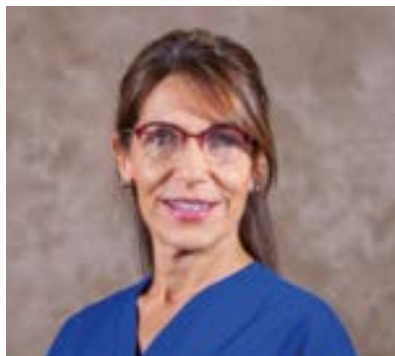
Laurie Clinical Staff