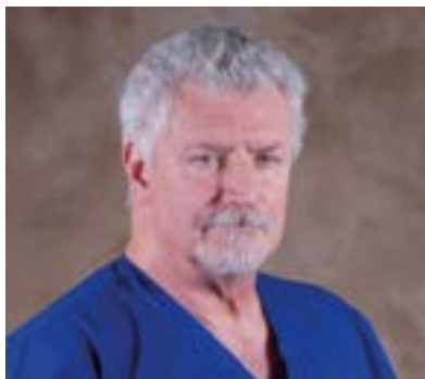
Leigh Clinical Staff