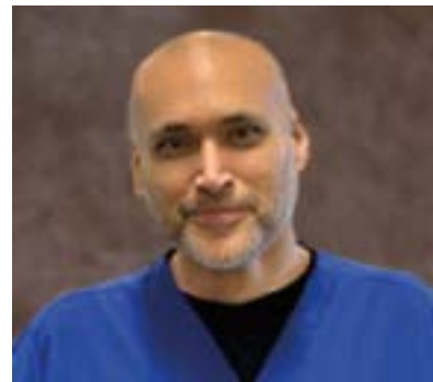
Attiq Clinical Staff