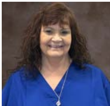
Romona Clinical Staff